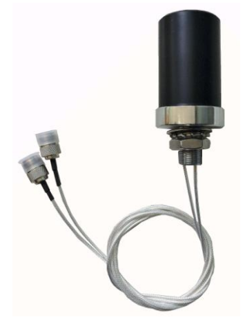
Note: The picture is for reference only, please kindly consult with the real product.